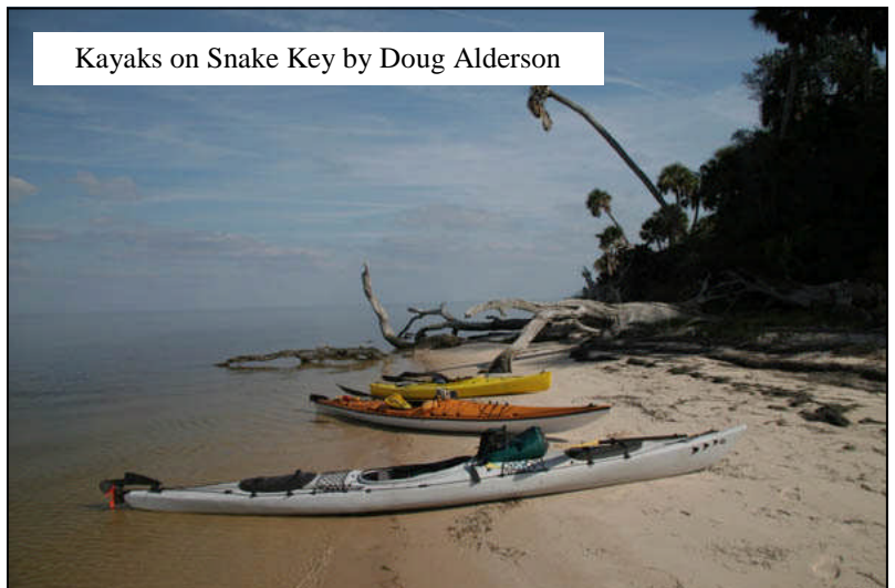
Kayaks on Snake Key

We need your skills and time to help the FPTA continue to move forward (see page 5).